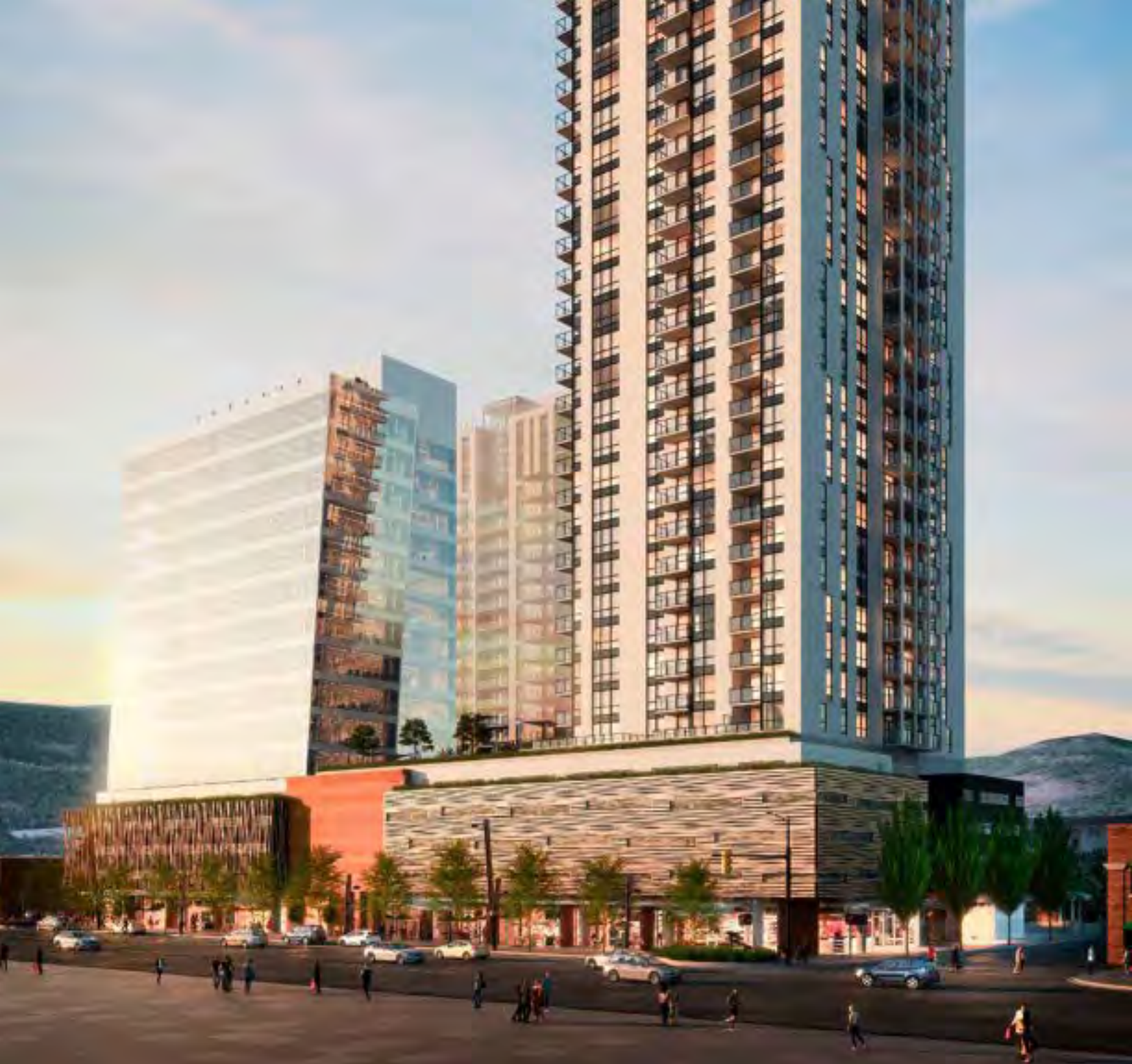
Corner of Bernard & Bertram