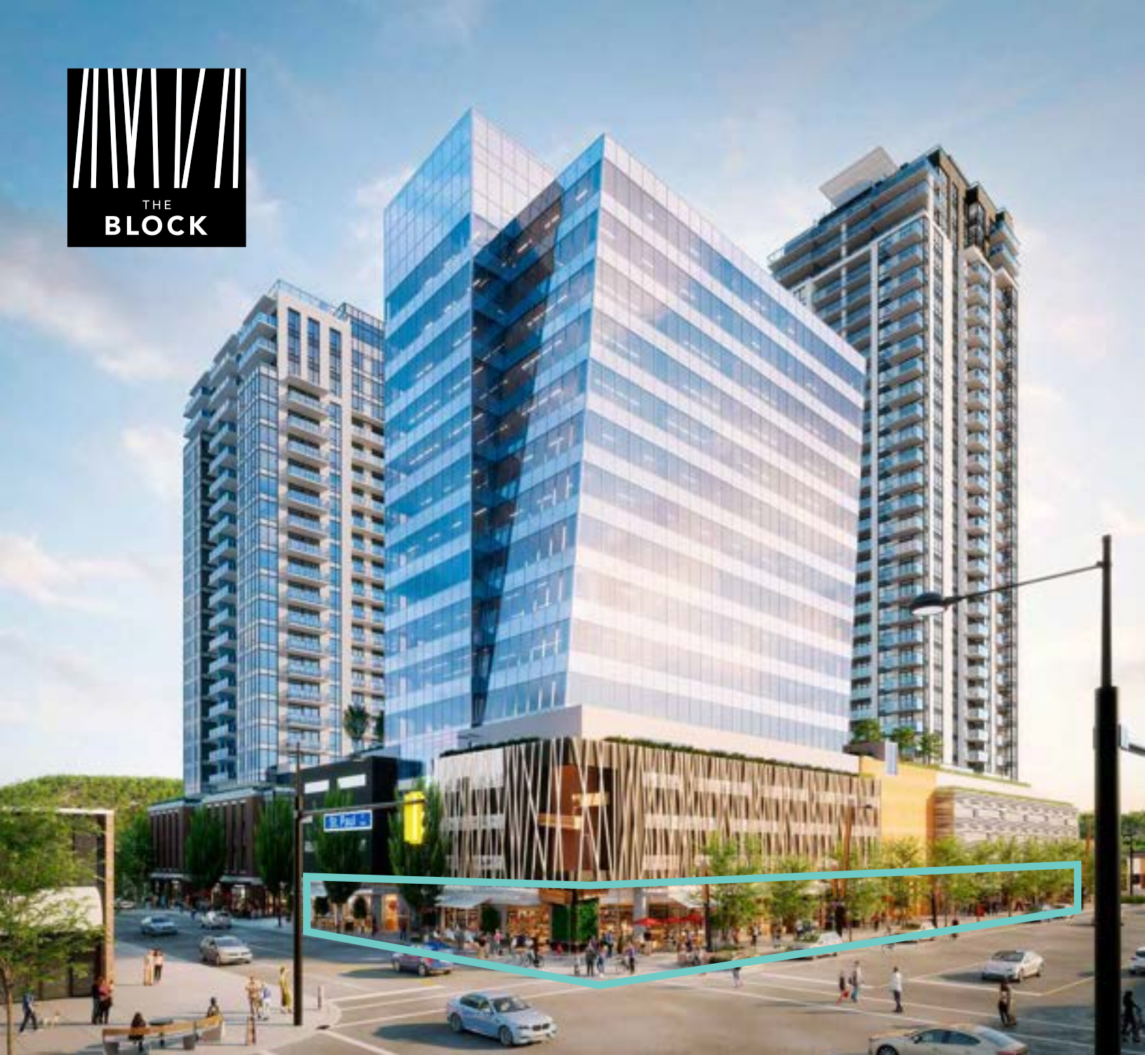
Corner of St Paul & Bernard