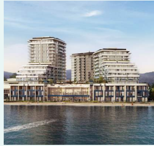
AQUA WATERFRONT RESORT KELOWNA, BC | 560 - 6,500 SF

As the centrepiece of a master planned urban village, the storefront retail spaces at The Block are the jewels of this iconic development, surrounded by over 400 homes, with a +/- 110,000 square feet of office space above you.