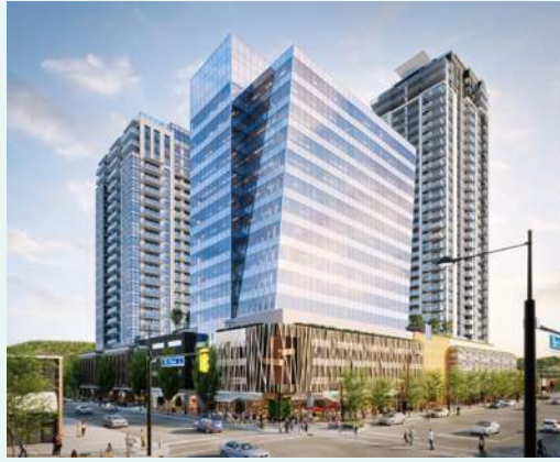
THE BLOCK KELOWNA, BC | 1,128 - 8,285 SF

This high-profile retail unit with frontage on pedestrian-friendly Westminister Avenue is minutes from downtown Penticton, and surrounded by a host of local restaurants, cafes and breweries.