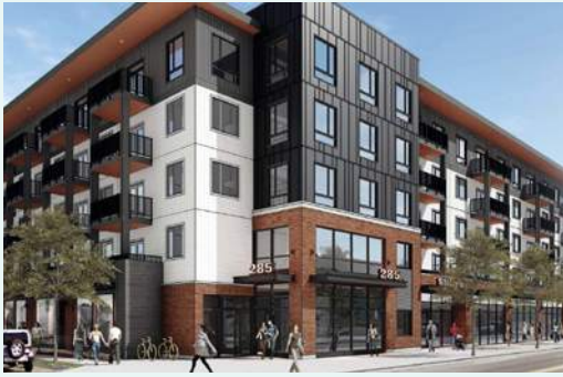
285 WESTMINSTER AVE PENTICTON, BC | 823 SF

This high-profile retail unit with frontage on pedestrian-friendly Westminister Avenue is minutes from downtown Penticton, and surrounded by a host of local restaurants, cafes and breweries.