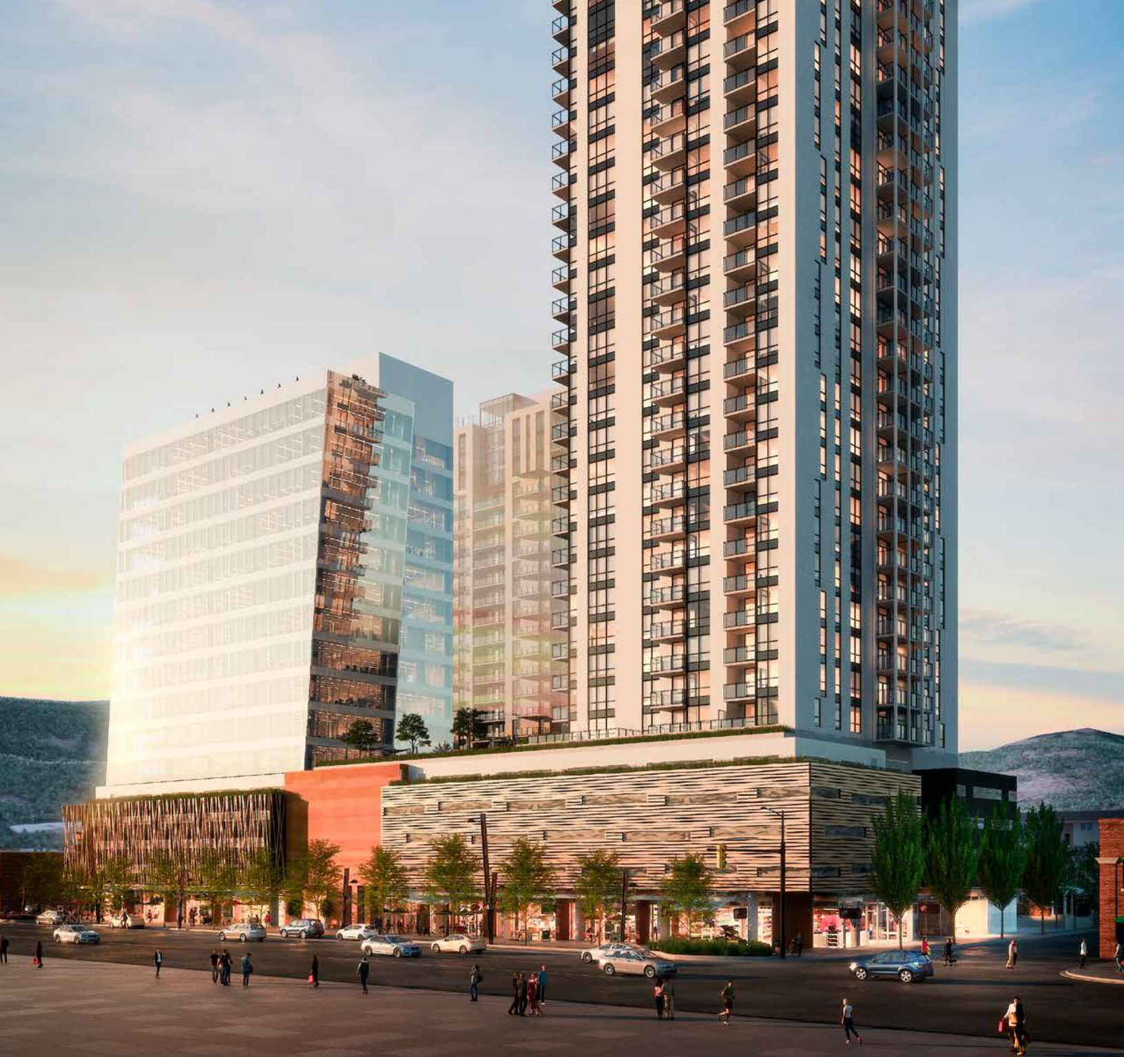
Corner of Bernard & Bertram