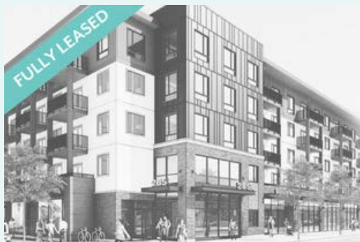
285 WESTMINSTER AVE PENTICTON, BC | FULLY LEASED

This high-profile retail unit with frontage on pedestrian-friendly Westminster Avenue is minutes from downtown Penticton, and surrounded by a host of local restaurants, cafes and breweries.