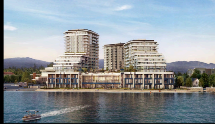
AQUA WATERFRONT VILLAGE LOWER MISSION KELOWNA, BC | 617 – 6,500 SF

As the centrepiece of a master planned urban village, the storefront retail spaces at The Block are the jewels of this iconic development, surrounded by over 400 homes, with a +/- 110,000 square feet of office space above you.