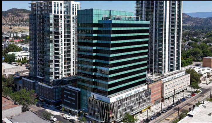
THE BLOCK DOWNTOWN KELOWNA, BC | 1,127 – 2,218 SF

As the centrepiece of a master planned urban village, the storefront retail spaces at The Block are the jewels of this iconic development, surrounded by over 400 homes, with a +/- 110,000 square feet of office space above you.