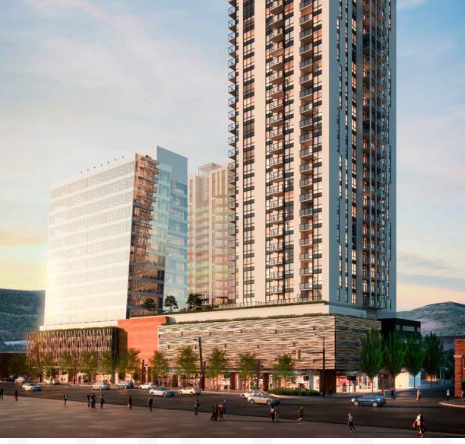
Corner of Bernard & Bertram